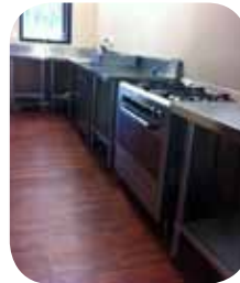
Fernbrook Winery, Margaret River