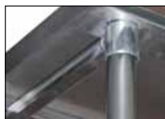
We've welded cross bars to the larger benches to make them insanely strong.