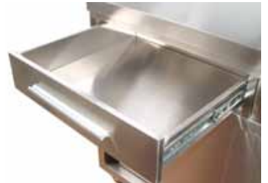
Drawer Detail Attractive Handles. Strong smooth runner. Plenty of storage space.