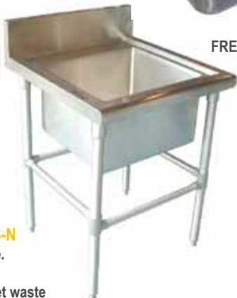
Sink - Code: SS-N Solid Standalone. 665mm x 700mm FREE Sink basket waste drainer included

*Sorry but due to the different drain size, this is our only sink that does not come with the free sink drainer.