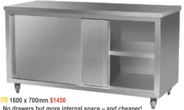
Code: CAB16070 1600 x 700mm $1450 A solid cabinet. No drawers but more internal space – and cheaper!

CUSTOM Please call for custom sizes and prices.