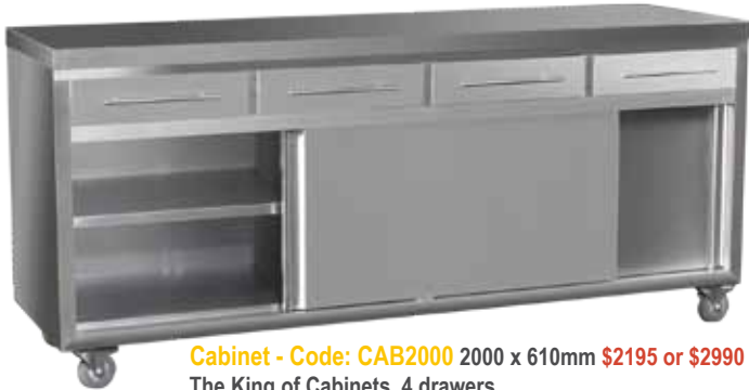
Cabinet - Code: CAB2000 2000 x 610mm $2195 or $2990 The King of Cabinets. 4 drawers. Available with castors or adjustable feet.