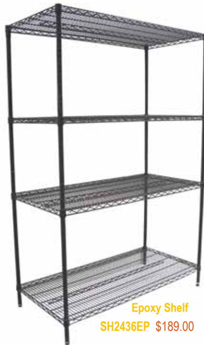
Epoxy Shelf SH2436EP $189.00