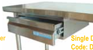
Single Drawer Code: DRS

Tek-screw some drawer units to any of our benches for a quick, cost-effective storage solution. About time we did this! A choice of either a single cutlery drawer or these 2 deep double drawers.