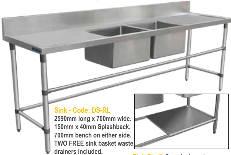
Sink - Code: DS-RL 2590mm long x 700mm wide. 150mm x 40mm Splashback. 700mm bench on either side. TWO FREE sink basket waste drainers included.