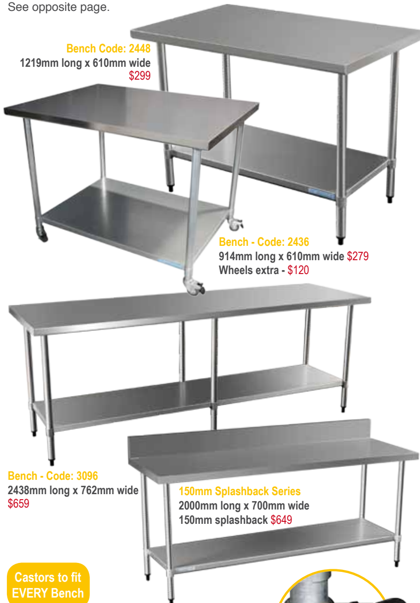
Bench Code: 2448 1219mm long x 610mm wide $299

Splashback & Corner Units: We have a full range of splashback benches in sizes from 400mm to 2400mm. Choose from 40mm or 150mm high splashbacks. All are 700mm deep to fit the sink profiles. The corner unit completes the modular approach! Narrow splashbacks are now available.