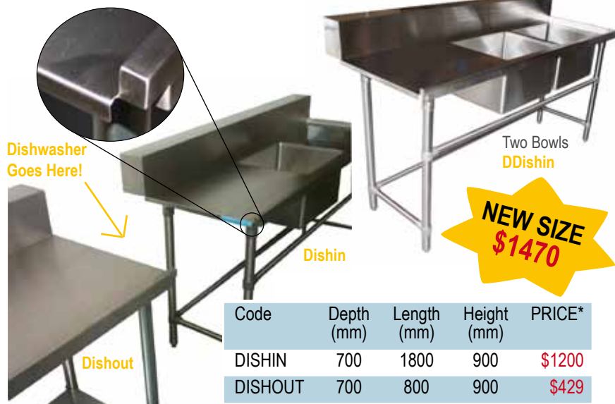
Dishwasher Goes Here!

For use with restaurant dishwashers. Either left or right configuration.