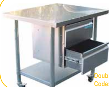
Double Drawer Code: DRD

To upgrade a bench code 2436 (normal price $279) - you can get just the stainless undershelf (add $75) and/or stainless legs (add $100). Total : $454.00