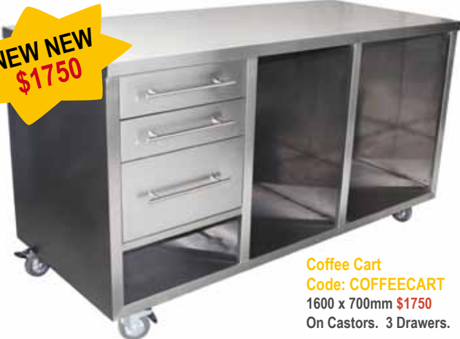
Coffee Cart Code: COFFEECART 1600 x 700mm $1750 On Castors. 3 Drawers.