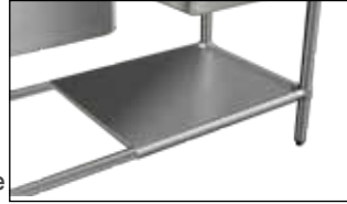
Sink Shelf Snap locks onto the support bars of the sink. $95.00 or $92.00 inc GST