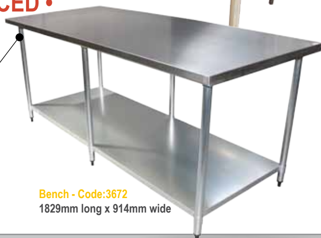
Bench - Code:3672 1829mm long x 914mm wide