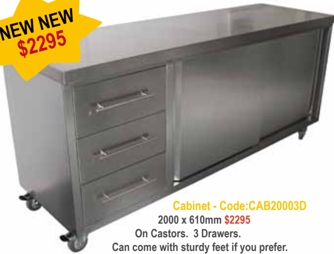
Cabinet - Code: CAB20003D 2000 x 610mm $2295 On Castors. 3 Drawers. Can come with sturdy feet if you prefer.