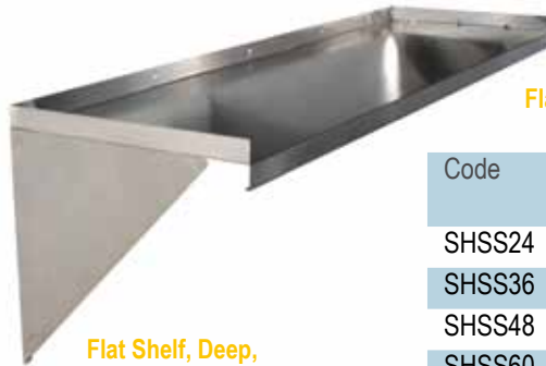
Flat Shelf, Deep, Perfect for deeper appliances

Wall Shelves in our Perth showroom. Note absence of costly overheads. No marble floors. No fancy-pants assistants with nothing to do.