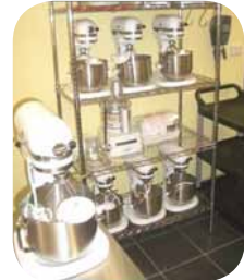
These guys love mixers!!

Mailing List Want to keep up with what we're doing? We'll email you any product updates as they happen. Just email your details to updates@stainlesssteelaustralia.com