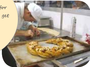
A talented pastry chef goes for Gold at the National Bakeskill Competition. Our benches take a hammering at this event every year.

If you've got an idea for a new product we can get it drawn up and costed in days. Call us today!