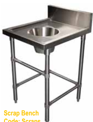
Scrap Bench Code: Scraps A splashback bench with a handy scraps chute