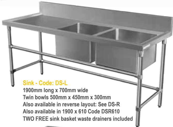
Sink - Code: DS-L 1900mm long x 700mm wide Twin bowls 500mm x 450mm x 300mm Also available in reverse layout: See DS-R Also available in 1900 x 610 Code DSR610 TWO FREE sink basket waste drainers included