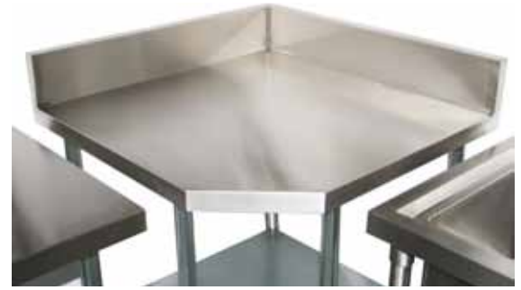
Corner Unit: Matches sinks and splashback benches $499

All Stainless: Yes, we have benches that are all stainless i.e the undershelf and legs are fully stainless steel. Perfect for extremely salty or chemical locations. See opposite page.