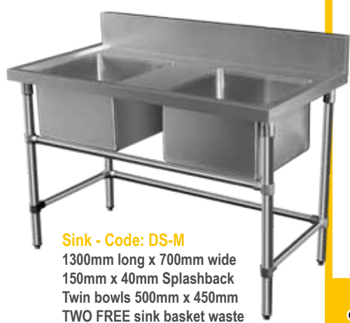
Sink - Code: DS-M 1300mm long x 700mm wide 150mm x 40mm Splashback Twin bowls 500mm x 450mm TWO FREE sink basket waste drainers included

"ABOUT TIME YOU DID THIS!" Durable, attractive taps to go with your sinks. At a price nobody can beat.