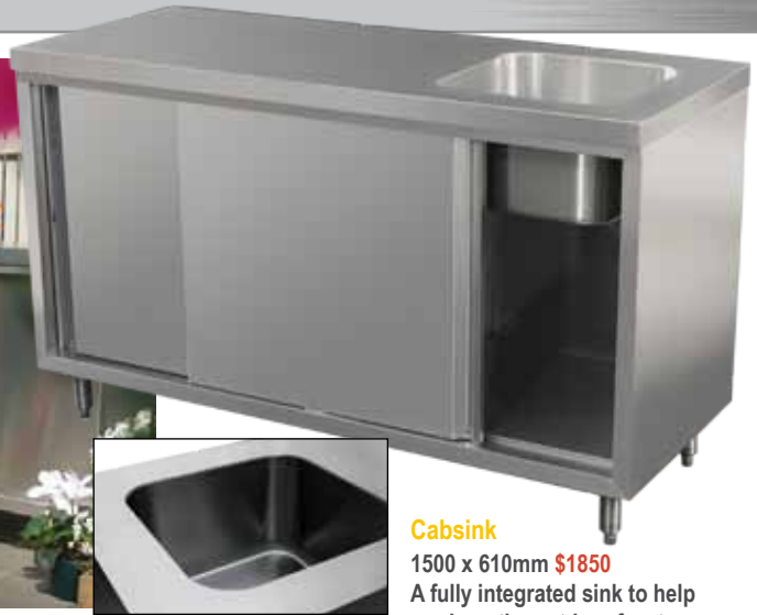
Cabsink 1500 x 610mm $1850 A fully integrated sink to help wash up the outdoor feast.

Cabinet Range The cabinet range is fully modular. We can fill almost any space and we can go around corners - just not quite as fast as 3 year-old Tom on his trike.