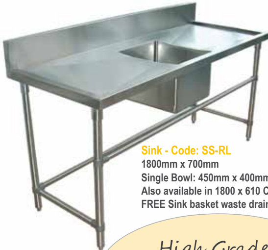
Sink - Code: SS-RL 1800mm x 700mm Single Bowl: 450mm x 400mm Also available in 1800 x 610 Code DSR610 FREE Sink basket waste drainer included