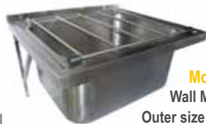
Mop Sink Wall Mounted

Outer size 610 x 530mm Bowl size 500mm x 400 x 250D