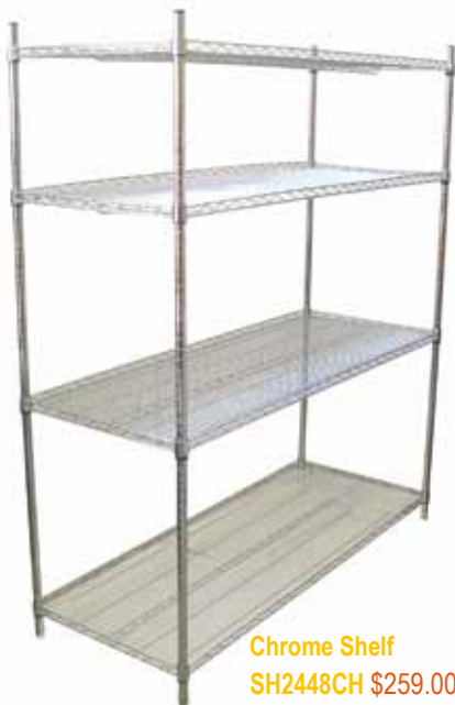
Chrome Shelf SH2448CH $259.00

FULLY ADJUSTABLE! You can fix the shelves anywhere along the upright and at any height!