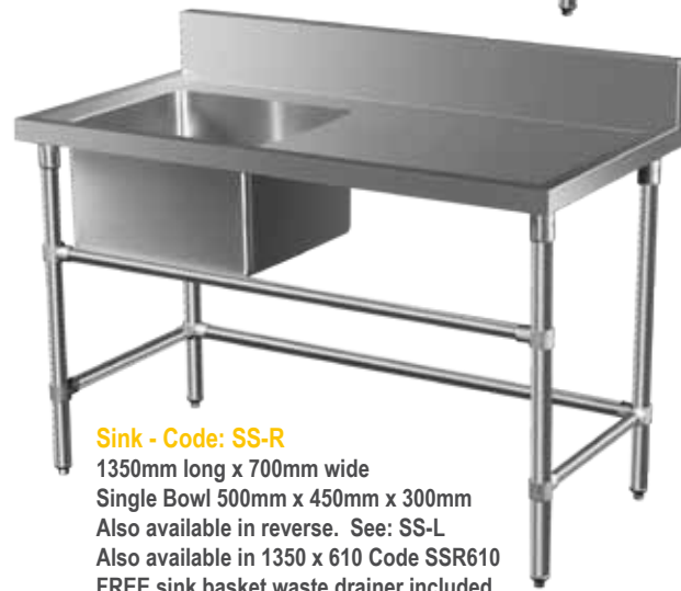
Sink - Code: SS-R 1350mm long x 700mm wide Single Bowl 500mm x 450mm x 300mm Also available in reverse. See: SS-L Also available in 1350 x 610 Code SSR610 FREE sink basket waste drainer included