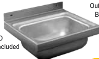
Wall Mounted Handbasin

Outer size 430 x 380mm Bowl size 350mm x 250 x 150D