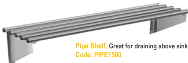
Pipe Shelf, Great for draining above sinks Code: PIPE1500