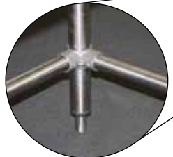
Height adjustable rails