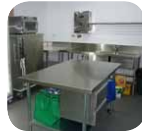
Manjimup Town Hall, kitchen upgrade